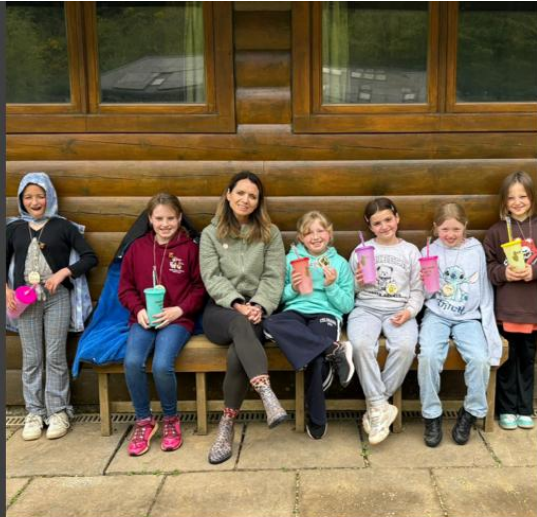
The Cabin Teams