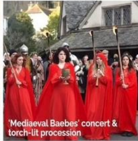
'Mediaeval Baebes' concert & torch-lit procession