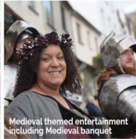
Medieval themed entertainment including Medieval banquet

Come celebrate the magic of Christmas in the medieval village of Dunster