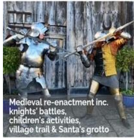
Medieval re-enactment inc. knights' battles, children's activities, village trail & Santa's grotto