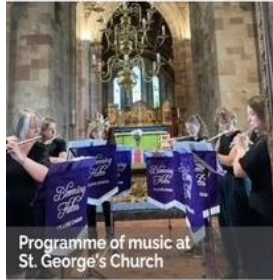
Programme of music at St. George's Church