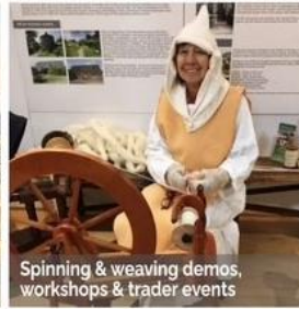
Spinning & weaving demos, workshops & trader events