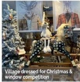
Village dressed for Christmas & window competition