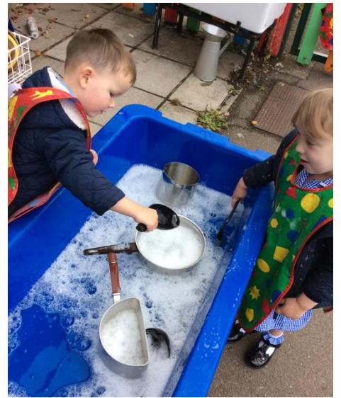
The first two weeks in Reception!