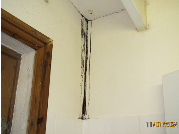
Leak or condensation needs treating