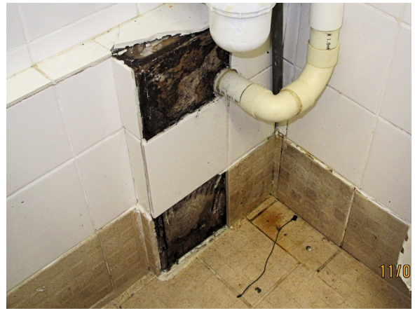
Some tiles require repair/replacement