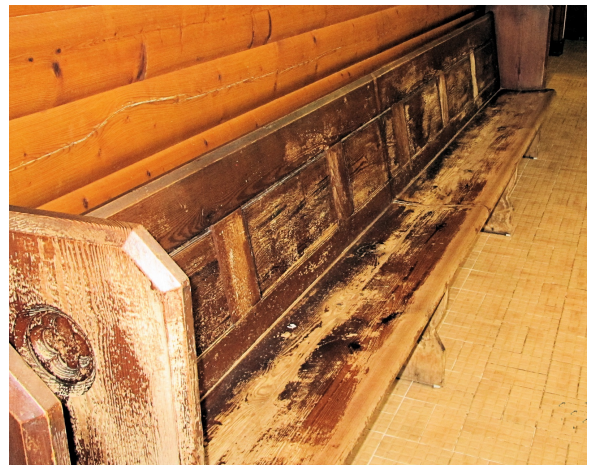
Seating could be improved