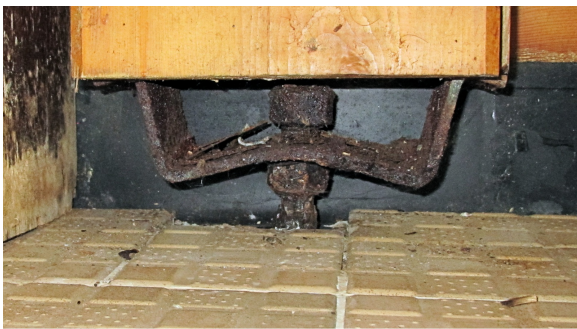
One (of four) main building supports