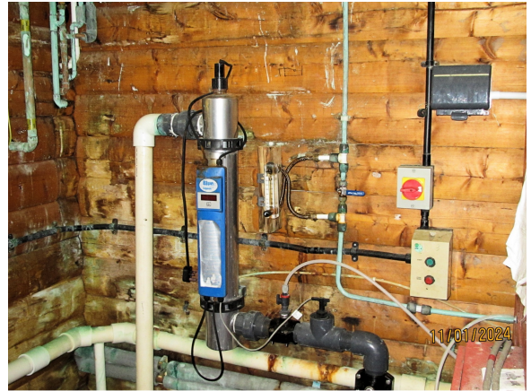
General deterioration of back wall and components in plant room