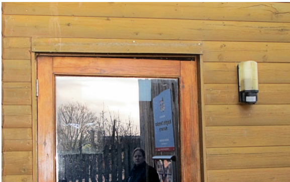
Simple canopy needed to deflect rain away from meeting room door