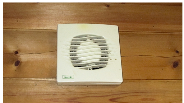
Extractor fan not working