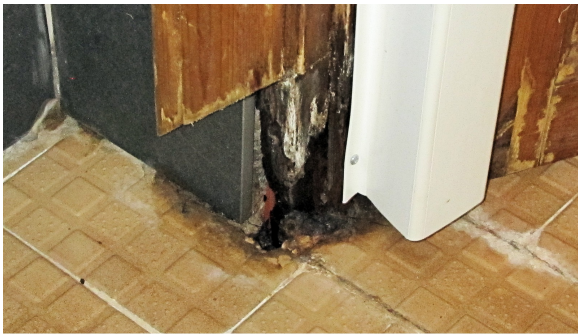
Black rot at bottom of many uprights needs treatment