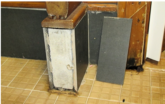
Tile off or damaged (typical)