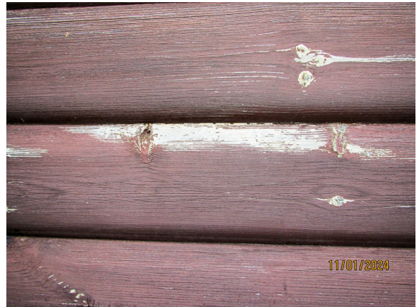
The limited area of original exposed wood badly needs recoating with Imprax-Elan