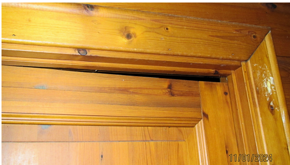
Changing-room doors are sagging