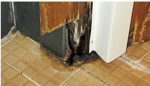
Black rot at bottom of many uprights needs treatment