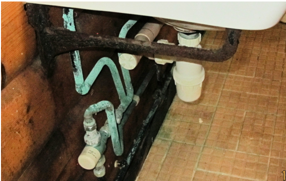
Corrosion on sink supports