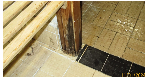
Black rot at bottom of many uprights needs treatment