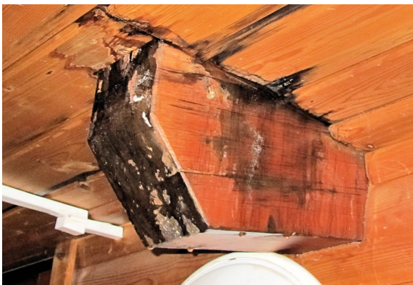
Condensation or Roof Leaking?