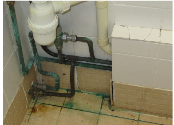
Tiles broken and pipe corrosion