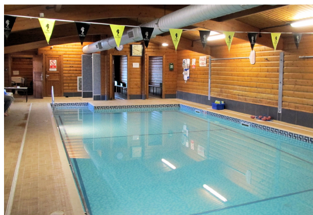
Pool: 12½ x 5 metres; 0.85-1.3metre deep

Two former swimmers, taught for many years in this pool, are currently competing in National Level events. Not bad for a small grass roots pool?