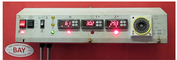
Calorex heat exchanger no longer able to maintain set temperature