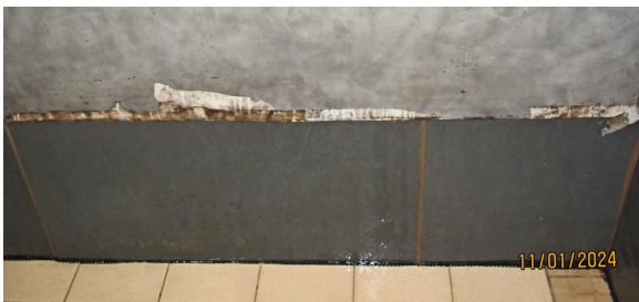
Deterioration of Bottom of Shower Cubicle Shower push-buttons also need renewal