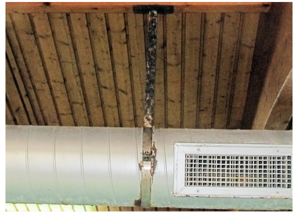
Corrosion on air pipe and supports