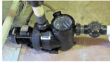
We continue to invest in our pool with a new state-of-the-art Chlorinator and recent Water Pump