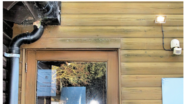
Simple canopy needed to deflect rain away from entrance door